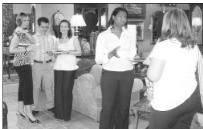
Members of the Tupelo Young Professionals are pictured at the March TYP event hosted by Staggs Interiors. For more information on the Tupelo Young Professionals, please visit www.typs.biz .