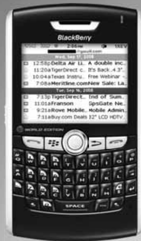
3G BlackBerry 8830 World Edition

1-877-CSOUTH2 (276-8842) cellularsouth.com/business