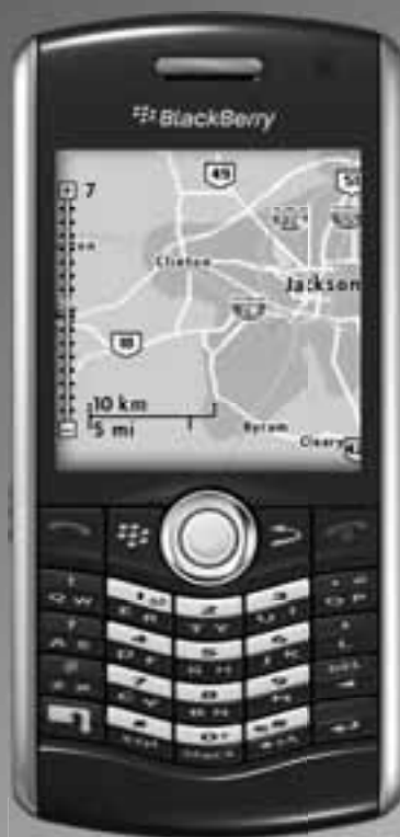
3G BlackBerry Pearl 8130