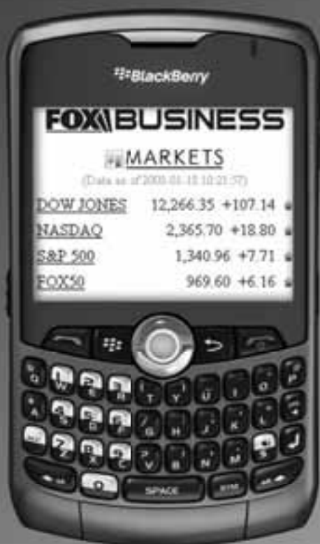
3G BlackBerry Curve 8330

With unlimited calls and data, you can stay connected, be organized and have instant access to information, all on the 3G network you can count on.