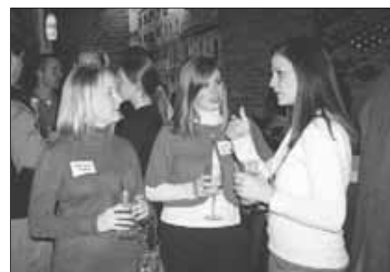
The February TYP event was held at Old Venice Pizza Company in Tupelo. Participants were treated to food, door prizes, and a wine tasting, courtesy of Old Venice Pizza Company. With over 85 TYPs in attendance, the group participated in a networking activity to meet other young professionals. Pictured are TYP members networking during the event.