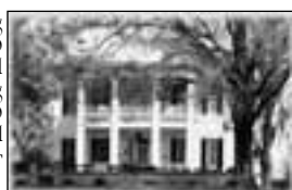
this historic 1857 cotton plantation mansions

Rosswood was a thriving cotton plantation of 1250 acres, long before the Civil War, with 105 slaves working the fields. It now has 100 acres of rolling fields and stately trees, where deer and other wildlife abound.