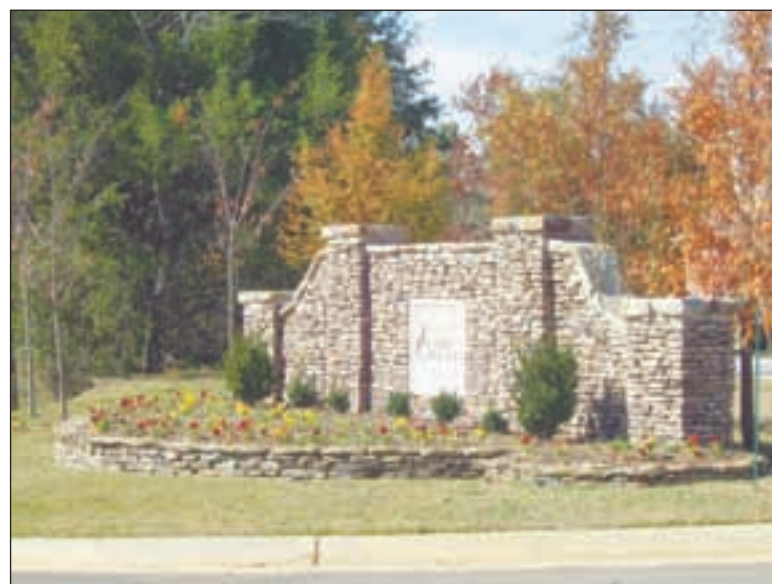
Pictured is the entrance to Lake Circle in Belden, by MG Landscape Group.

cial development master planning and recreational facility master planning.